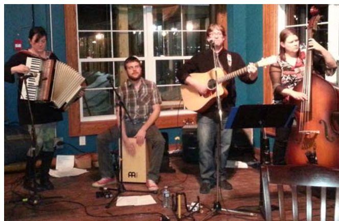
The Worry Birds