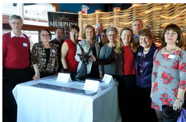
25th Anniversary Committee