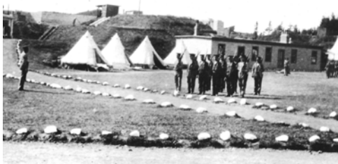
Fort Ives During WWI