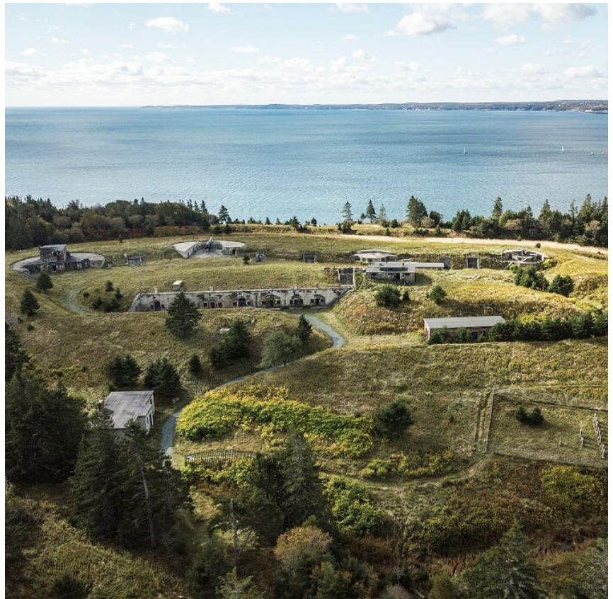
Aerial view of McNabs Island as part of Halifax Defence Complex

Our meeting also presented us the opportunity to discuss collaboration by the Friends with Parks Canada, and the possibility for renewal of a formal agreement to allow the Friends to help with maintenance and projects at Fort McNab.