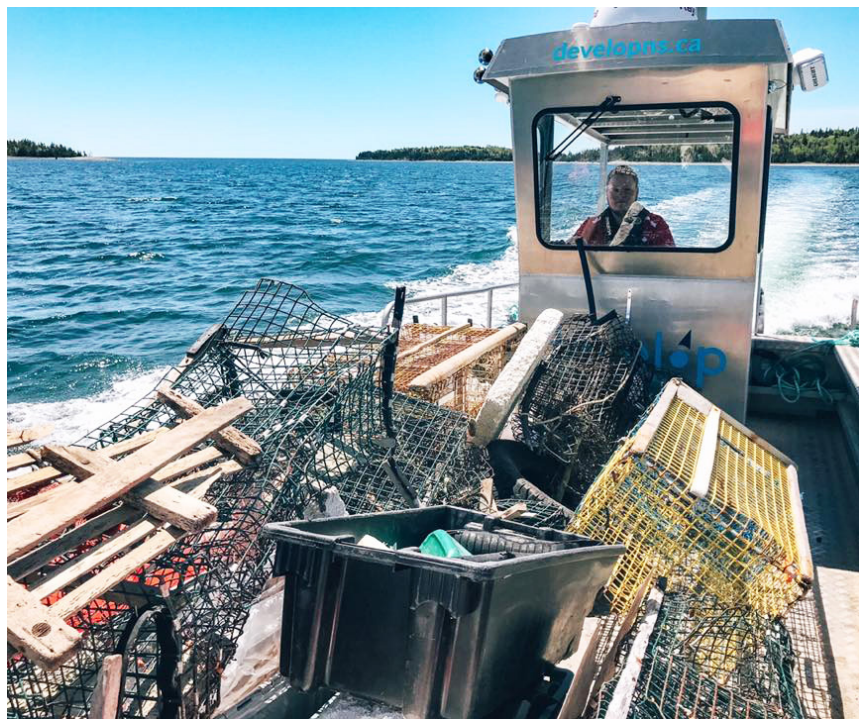
Hauling away garbage Beach Cleanup 2019