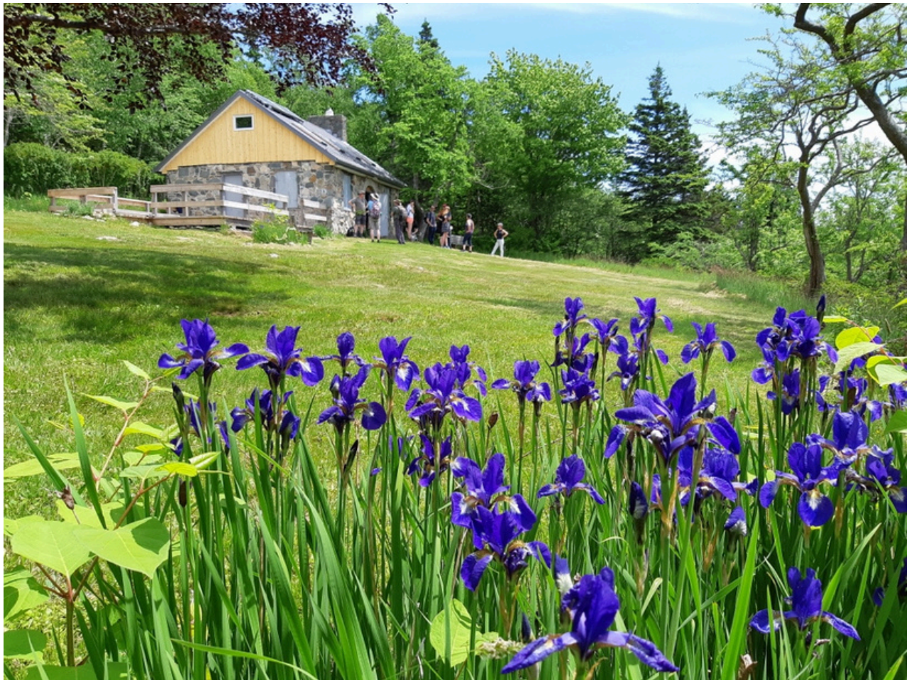
Springtime at our McNabs Island Teahouse Outdoor Education Centre which was renovated entirely by our volunteers.

Join our team of volunteers on McNabs Island this Spring!