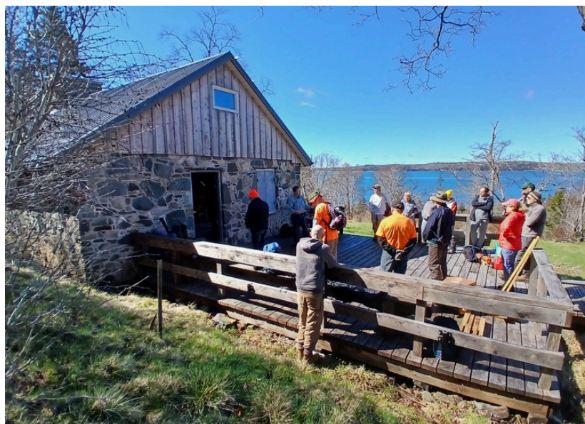
McNabs Island Volunteers discussing work day plans - May 2, 2026