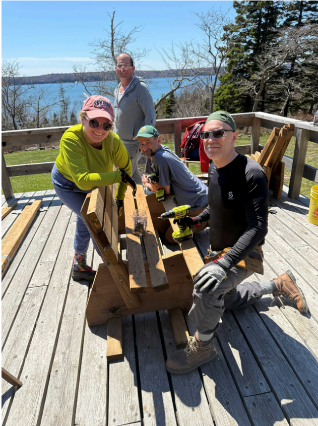
McNabs Island Volunteers building a park bench May 2, 2026