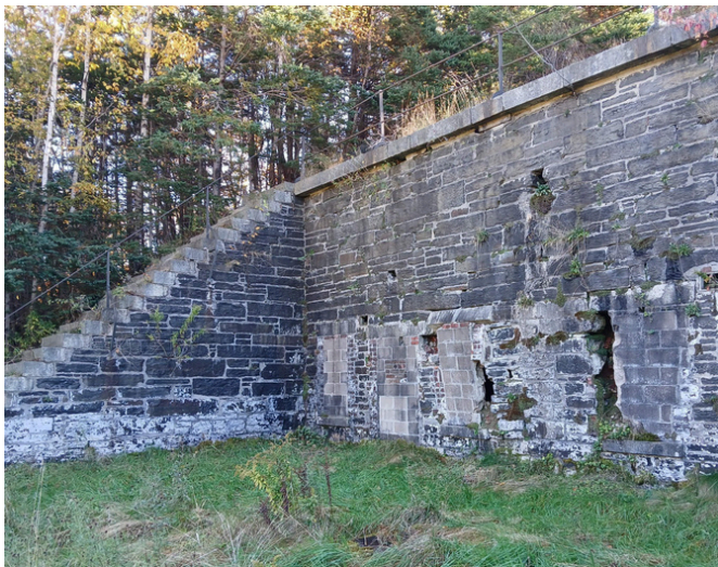
Deteriorating Revetment Wall at Ives Point Battery.