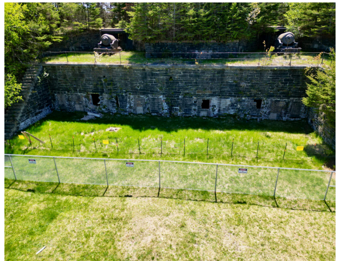
Fencing to contain the crumbling revetment wall at Ives Point Battery

The engineering report determined that urgent repairs were needed in several areas including stabilizing the Barrack Casemate Ironstone Revetment Wall where the two 10" Rifled-Muzzle Loading guns are still mounted in their original 1870s emplacement. The report recommended that the 16' Revetment Wall and the 8' and 9' walls beneath the Breech-Loading Battery Position and Magazine be fenced off as these areas are a public safety hazard. The report detailed a list of repairs needed to all of the military buildings at Ives Point Battery. The estimated cost of repairs amounts to approximately $7,000,000. As far as we know, there are no plans to do any repairs to Fort Ives Battery.