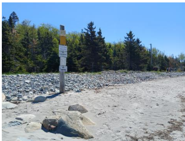
Former Nova Scotia Power pole near Garrison Pier is a reminder of where the power lines used to be. Storms and sea level rise have moved the shoreline overtopping Garrison Road with beach cobble.

The Friends of McNabs are often asked to organize field trips for groups visiting the city. If you know of a group interested in an island field trip, please get in touch with us.