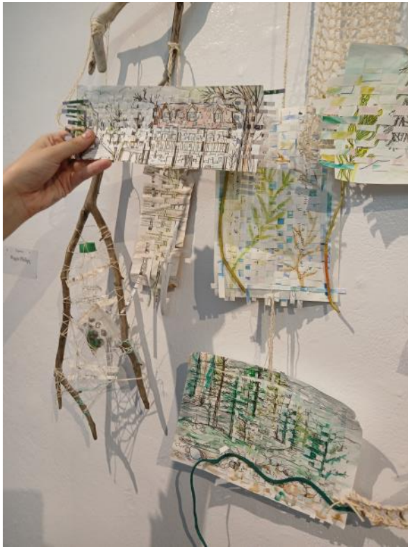
Maggie Phillips' woven creation called "Fragments" consists of woven fabric and paper including sections of our own Discover McNabs Island map.