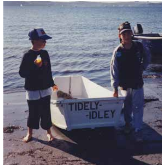
Young Sailors during June of 1992