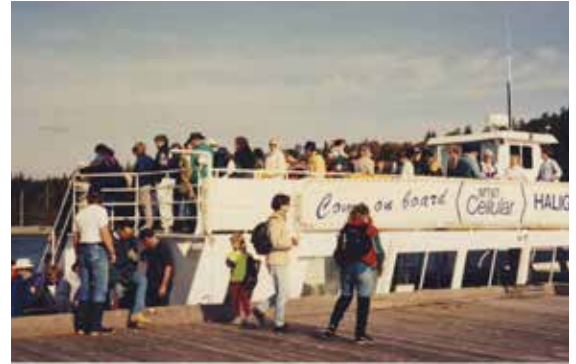
Island Visitors C. 1992