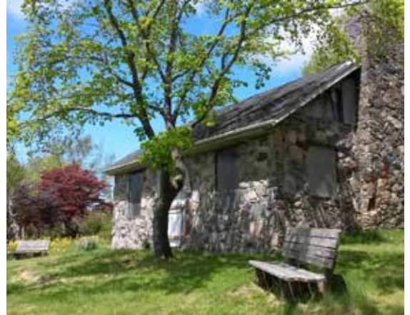
The Teahouse in 2017