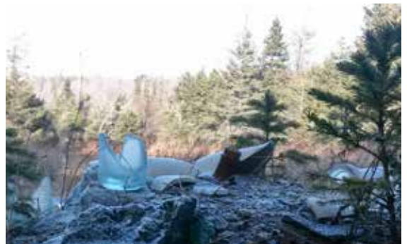
The ruins of the A J Davis Bottling Plant where "Pure McNab" was made