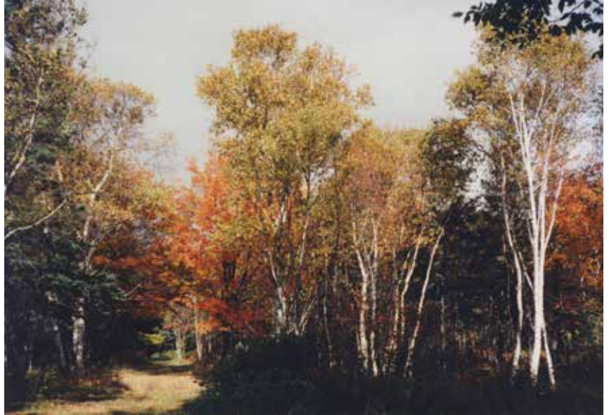
Old Military Road Oct.'97

On a cloudy Sunday morning in early August 1997, I was up at Fort McNab and was looking about when I noticed tunnels in a clump of Japanese Knotweed then growing to the northwest of the buildings. I went to investigate and started to crawl into one, when discovering it was too low to have been used by deer, I suddenly remembered someone had told me coyote was on the Island and had been seen a few times since June. I backed out quickly. After eating my lunch up near the Radar building and sun shining I decided to go down the Searchlight Trail. I had only gone a short distance when some further down a coyote with a squirrel in its mouth flashed across the trail. I then heard two quiet YIP YIP and she was calling her two pups to eat.