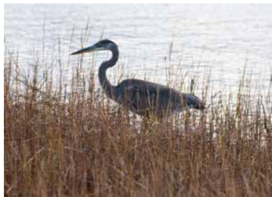
Great Blue Heron