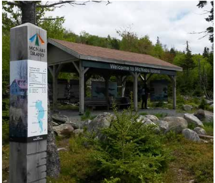
The Kiosk on McNabs in 2017

For some time, we’ve been working with the Halifax Regional Trails Association (HRTA) to convince HRM to fund recreational community-built trails throughout the municipality. Nine other trail groups within the collective of twenty-three trail groups that make up