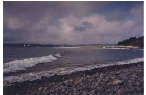
Maugers Beach in the Early 90s