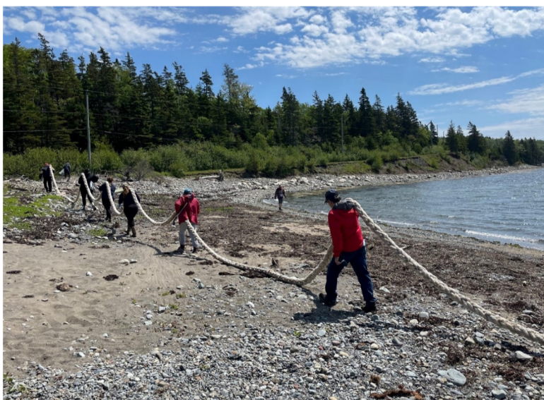
McInnis Cooper Group using teamwork to move a rope.

The Friends of McNabs Island Society greatly appreciates the yearly involvement of this reliable, and hard-working group and their dedication to ridding the island of trash.