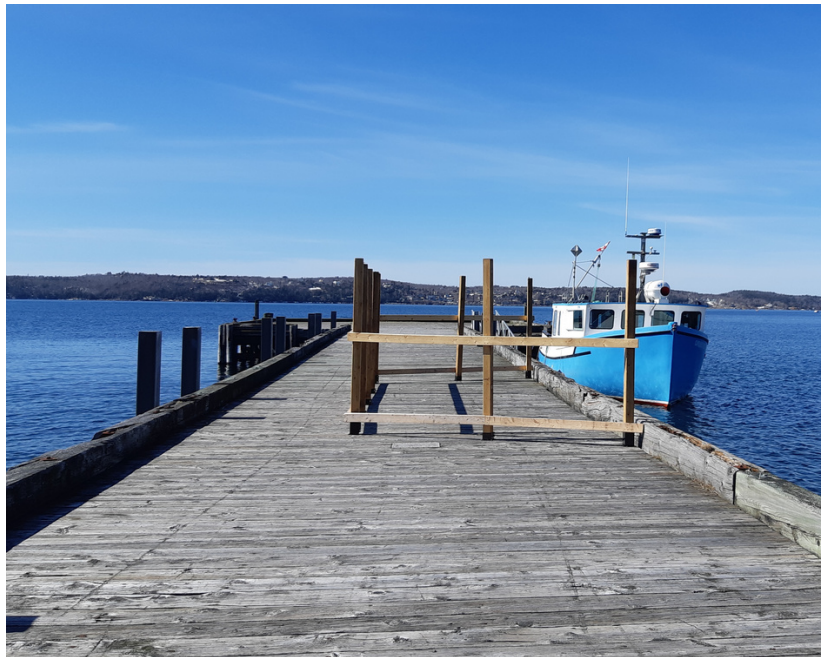
2x4 barricade on Garrison Pier deters people from walking on that side of the pier because one of the pilings has given way

McNabs Island is already financially inaccessible for many people because of the high cost of transportation to get to the island. If this plan to relocate the main access pier to Timmonds Cove goes ahead, the island will become even more inaccessible, except for avid hikers who can make the long 6 km round trip trek to Fort McNab National Historic Site or the shorter 4 km round trip to Maughers Beach – two of the most remarkable features of interest that draw visitors to McNab Island.