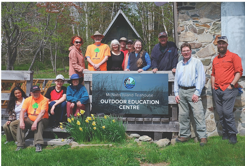
Teahouse Outdoor Education Centre work party May 20 2023

On the deck of the OEC, our volunteers have installed an information panel highlighting the history and use of the Teahouse. We are also considering installing some interactive activity modules in the woods near the Centre, specifically aimed at youth, but also to engage program participants and passers-by alike.