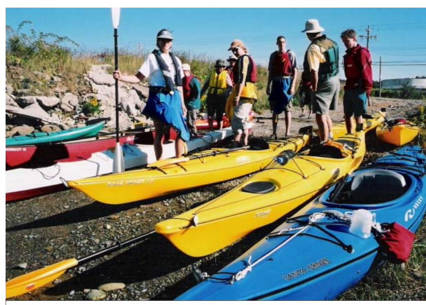
Enthusiastic paddlers ready to put in from Dooks Wharf