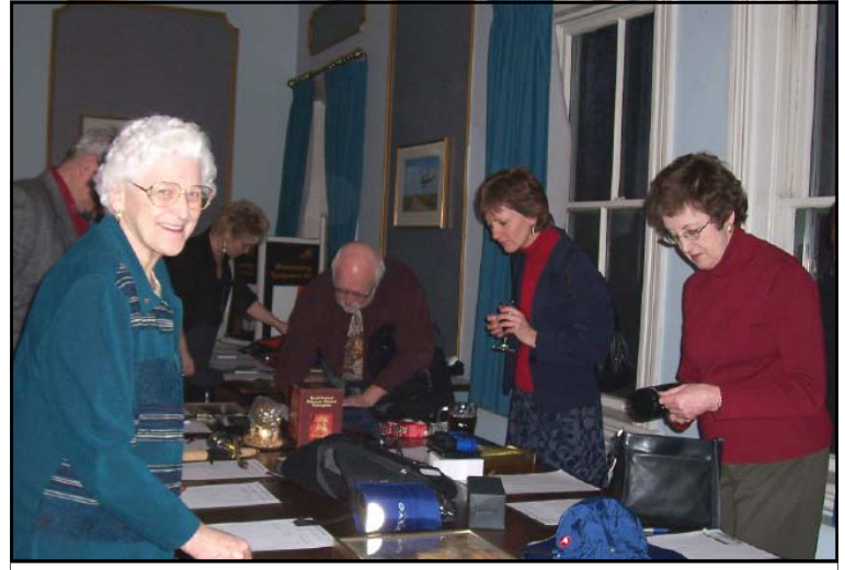
Friends admiring the Auction Items