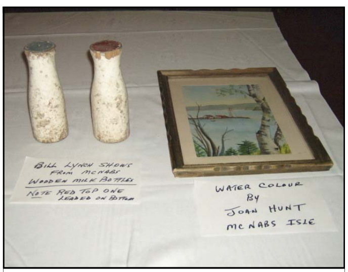
Artifacts of McNabs Island on display at the Dinner & Auction courtesy of Bill Mont